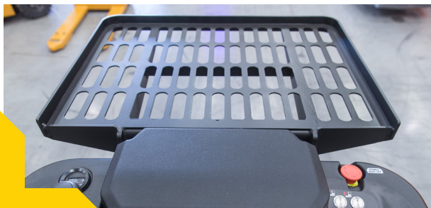
FRONT LOAD TRAY